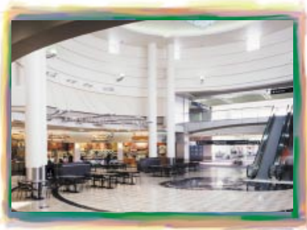
Food Court in Concourse C at North Star Crossing.