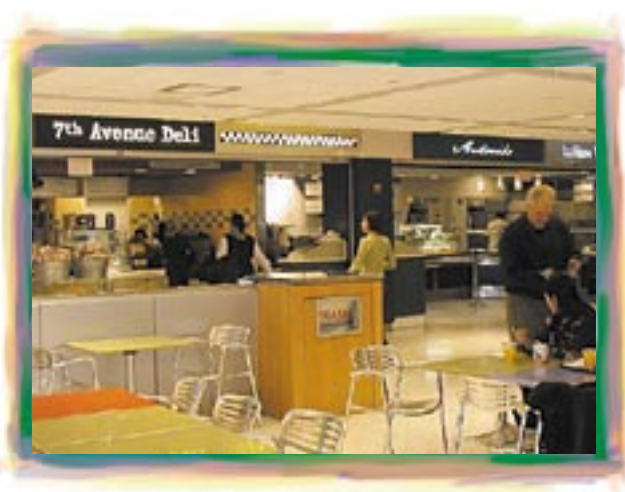
Concessions at JFK's terminal 7

Category 4: Airport with Most Innovative Services