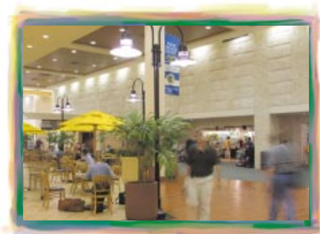
Concessions at Palm Beach International

Category 5: Airport with Best Overall Program