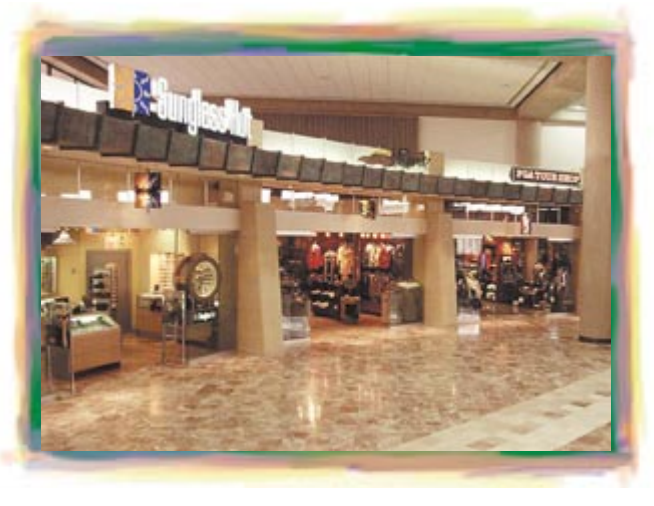
Concessions at Phoenix International's Terminal 3

Categories 1: Airport with Best Program Design Category 2: Best Redeveloped Program