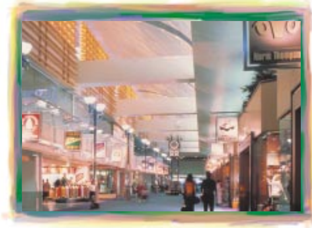
Portland’s Oregon Market