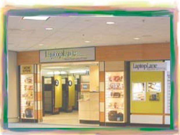
Laptop Lane at Cincinnati International Airport

Category 4: Airport with Most Innovative Services