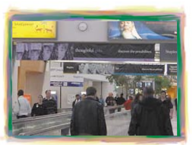
Newark's Terminal C

Category 3: Airport with best Management Team Category 5: Airport with Best Overall Program